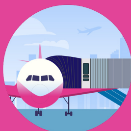
Gate Management Systems (GMS)