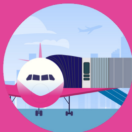
Gate Management Systems (GMS)